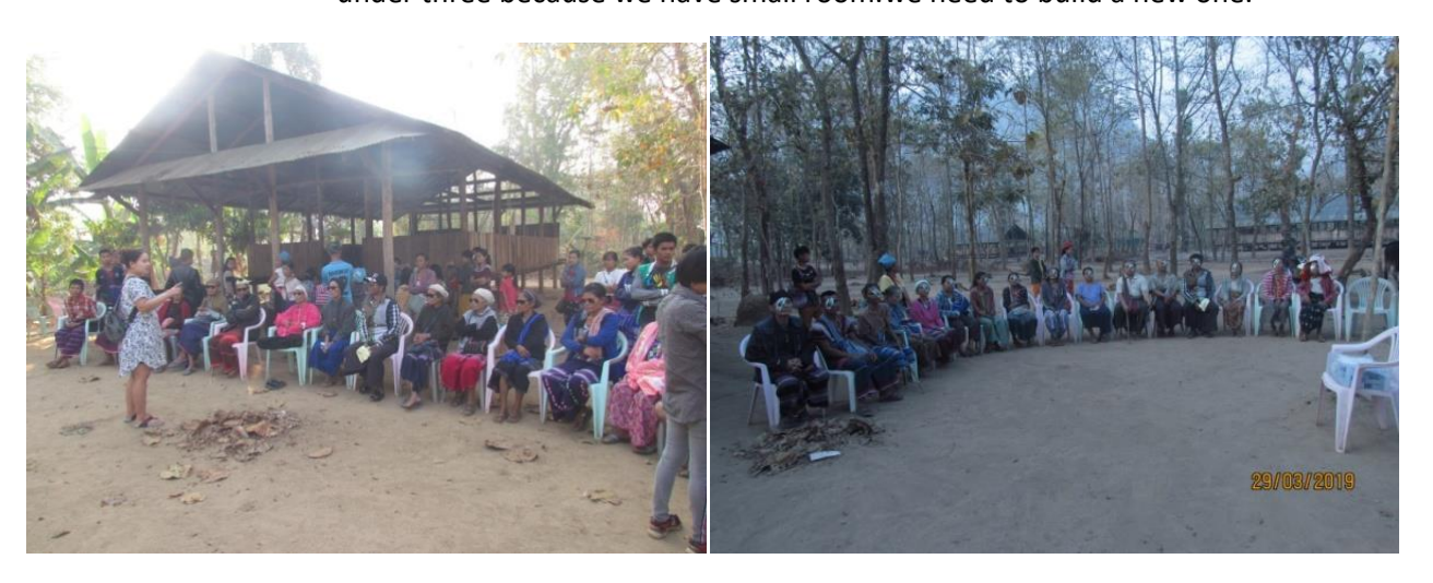
(7)- 2019 April 20 eye mission Shan state Lai Tai Lang Hospital

(6). March 2019 Eye mission Pa An district / They Bay Tar Clinic see patient on the ground under three because we have small room.we need to build a new one.