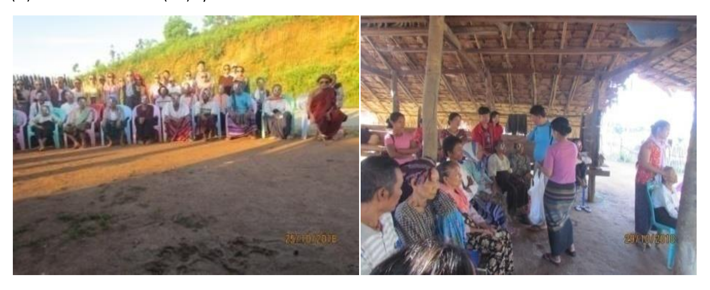
(4). Dawel District (K4) Ta Boh Tar Village eye mission February 2019