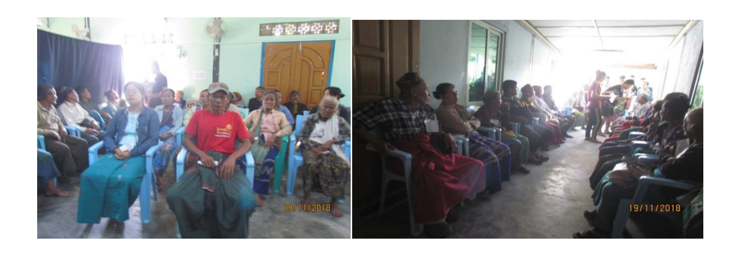
(9) Kler Lwe Too District Eye Mission Ler Wah clinic November 2018